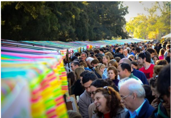
Buenos Aires Market